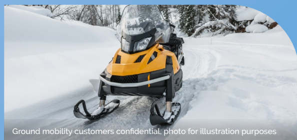
Ground mobility customers confidential, photo for illustration purposes