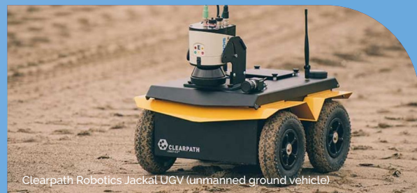
Clearpath Robotics Jackal UGV (unmanned ground vehicle)