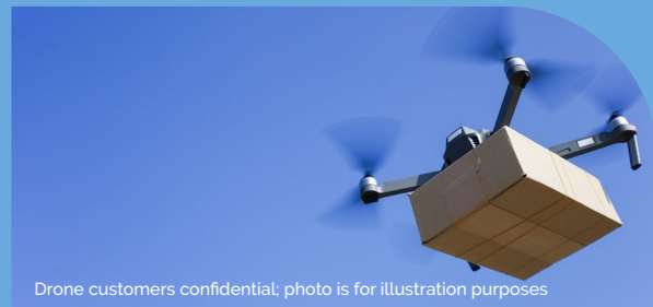
Drone customers confidential, photo is for illustration purposes